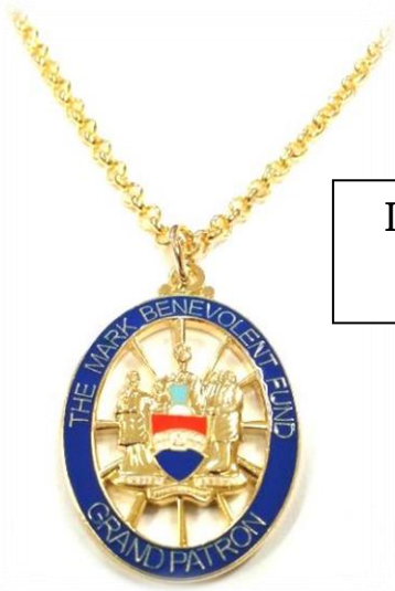
Ladies Grand Patron worn as a Pendant