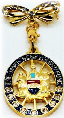
Ladies Grand Patron Diamond