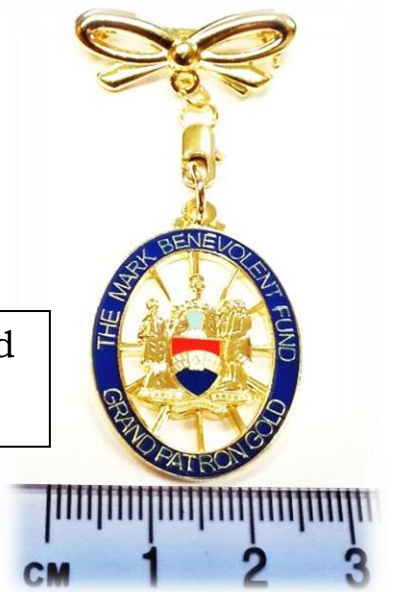
Ladies Grand Patron Gold worn as a Brooch