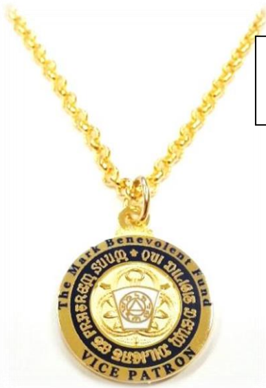
Ladies Vice-Patron worn as a Pendant