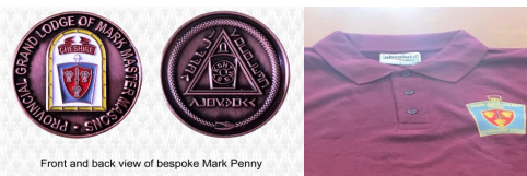
Front and back view of bespoke Mark Penny