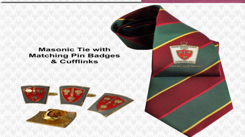
Masonic Tie with Matching Pin Badges & Cufflinks