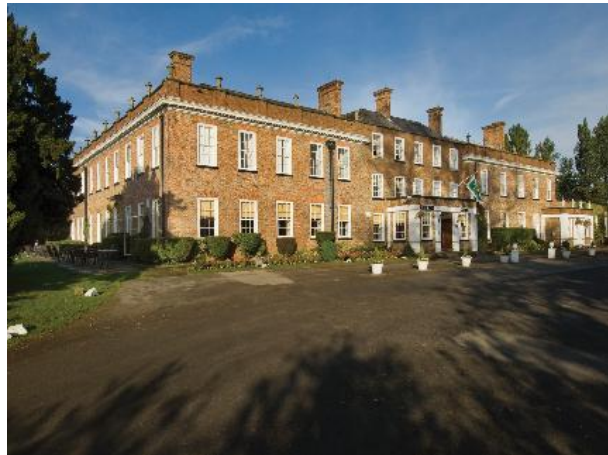
The Blackwell Grange Hotel, Darlington

The total cost of the weekend will be £165 per person, although we can offer 3 nights dinner, bed and breakfast for £210.00 per person and 4 nights DBB for £250.00 per person. A non-returnable deposit of £65 per person is required at the time of booking. The balance is payable by 28th February 2017. It is anticipated that this will be a very popular event and bookings will be taken strictly in order of receipt.