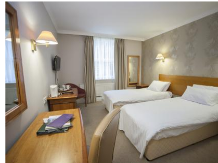
One of the well-appointed bedrooms at the Blackwell Grange Hotel

For the golfers among you, the neighboring Blackwell Grange Golf Club has offered the special price of £17.50 (reduced from £25.00).