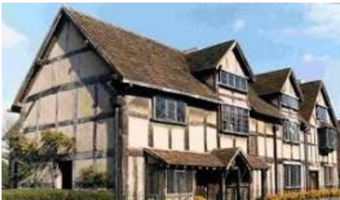
SHAKESPEARE'S BIRTHPLACE ... one of the many attractions that Stratford-upon-Avon has to offer

The weekend will consist of an informal hot buffet of five seasonal salads, Cold meat platter, hot vegetable medley and a selection of bread rolls & butter at 7.30 p.m. on the Friday evening