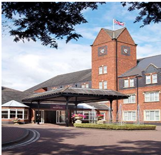
THE Park Royal Hotel Warrington, the venue for the launch of the Festival