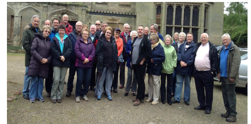
The Mark group's visit to Guy's Cliffe