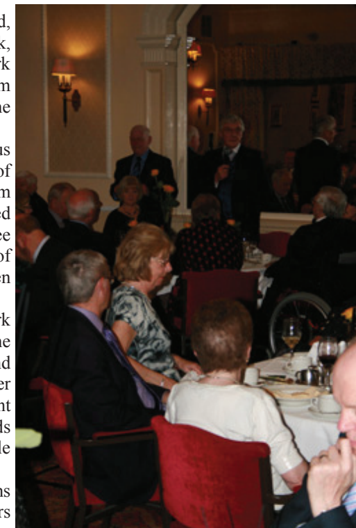
■ The Provincial Grand Master addresses the members, wives and friends at the dinner at the Hydro Hotel

The team have switched the venue and date for 2014 to the splendid four-star Chesford Grange Hotel at Kenilworth, near Warwick from 9 th to the 11 th of May. Please book early when the event is formally announced to avoid disappointment.