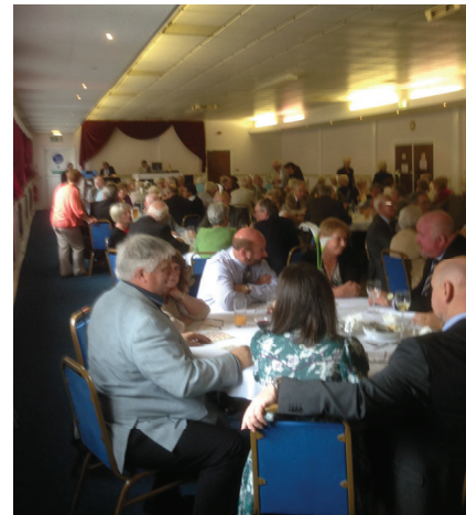
The Salmon Lunch at Ellesmere Port in full swing

MORE than 90 Mark Masons, families and friends from the West end of Cheshire Mark Province enjoyed the 2013 Salmon Lunch at Ellesmere Port Masonic Hall in September.