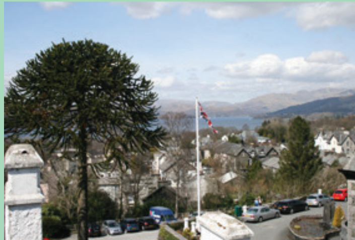
The beautiful view over Lake Windermere from one of the rooms at They Hydro Hotel in Bowness, which is proving such a popular venue for the Mark Weekend Away.