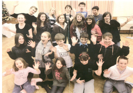
Some of the members of the Middlewich Youth Theatre

"Six hens and a cockerel, and grow your own vegetables; eggs from woodpigeons nests or any other nest you can find; catch fish from the canal. All these 'luxuries' could be added to your weekly ration of 2oz of butter, margarine, and sugar." This was just some of the information gathered by a group of youngsters in Middlewich when they set out to try and discover what life was like in the town during the 1939-1945 war. They patrolled the town centre, visited the homes of the elderly, and asked questions in a way that only youth can, and they got the kind of answers that only first-hand experience of the war years can provide.