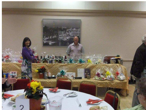
The groaning raffle prize table

This year's East End Salmon Lunch was again a great success.