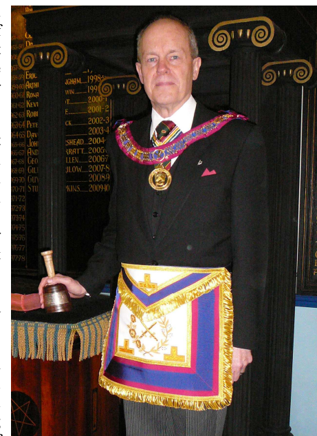
Our new Assistant Provincial Grand Master pictured at Congleton Masonic Hall