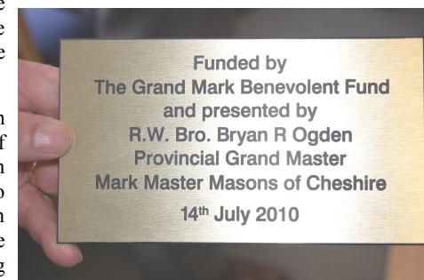
The commemorative plaque which the Unit bears