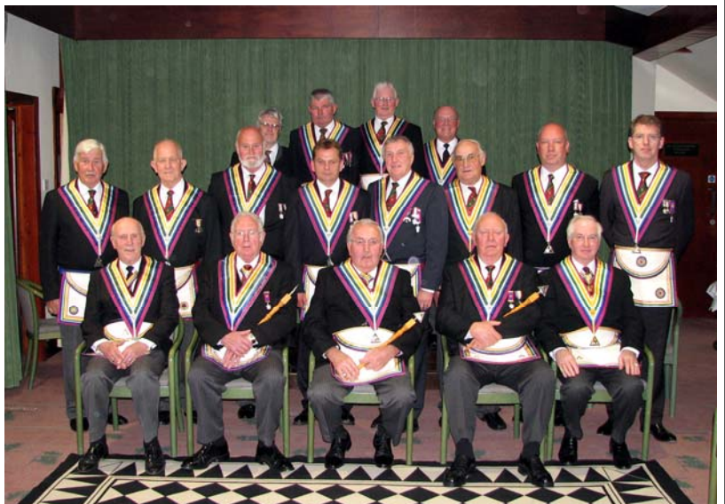
The Founders of Tarporley Lodge RAM

We wish Tarporley Lodge every success for the future.