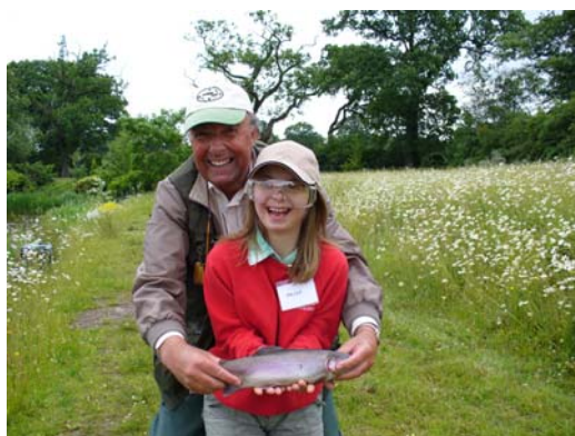
A selection of pictures taken at the MTSFC Marton Heath Fishing Day