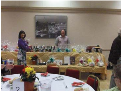
The groaning raffle prize table

This year's East End Salmon Lunch was again a great success.